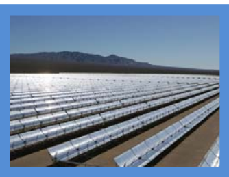
Nevada Solar One

Developer: Acciona Electricity Purchaser: NV Energy Location: Boulder City, NV Technology: Trough Capacity: 64 MW Source: Acciona North America