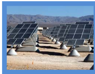
Nellis Air Force Base

Developer: eSolar Electricity Purchaser: Southern California Edison Location: Antelope Valley, CA Technology: Tower Capacity: 5 MW