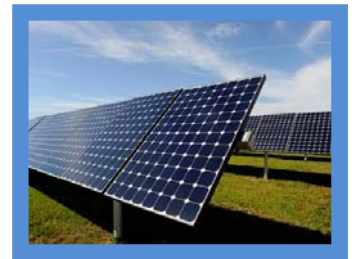
DeSoto Next Generation Solar Energy Center

Developer: MMA Renewable Ventures Electricity Purchaser: Nellis AFB Location: Clark County, NV Technology: PV Capacity: 14 MW