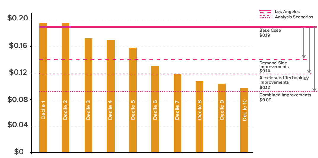
FIGURE ES3: U.S. SOUTHWEST 2024 OFF-GRID COMMERCIAL SCENARIOS VS. ESTIMATED UTILITY DECILES [Y-AXIS - 2012$/kWh]

Though many utilities rightly see the impending arrival of solar-plus-battery grid parity as a threat, they could also see such systems as an opportunity to add value to the grid and their business models. The important next question is how utilities might adjust their existing business models or adopt new business models—either within existing regulatory frameworks or under an evolved regulatory landscape—to tap into and maximize new sources of value that build the best electricity system of the future at lowest cost to serve customers and society. These questions will be the subject of a forthcoming companion piece.