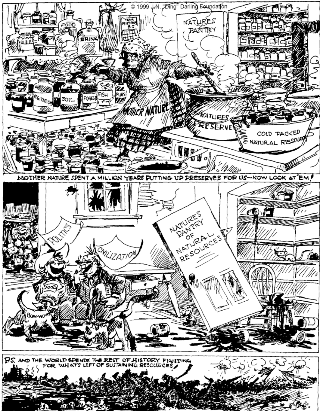
Figure 1–2. 1936 Cartoon by Jay N. “Ding” Darling