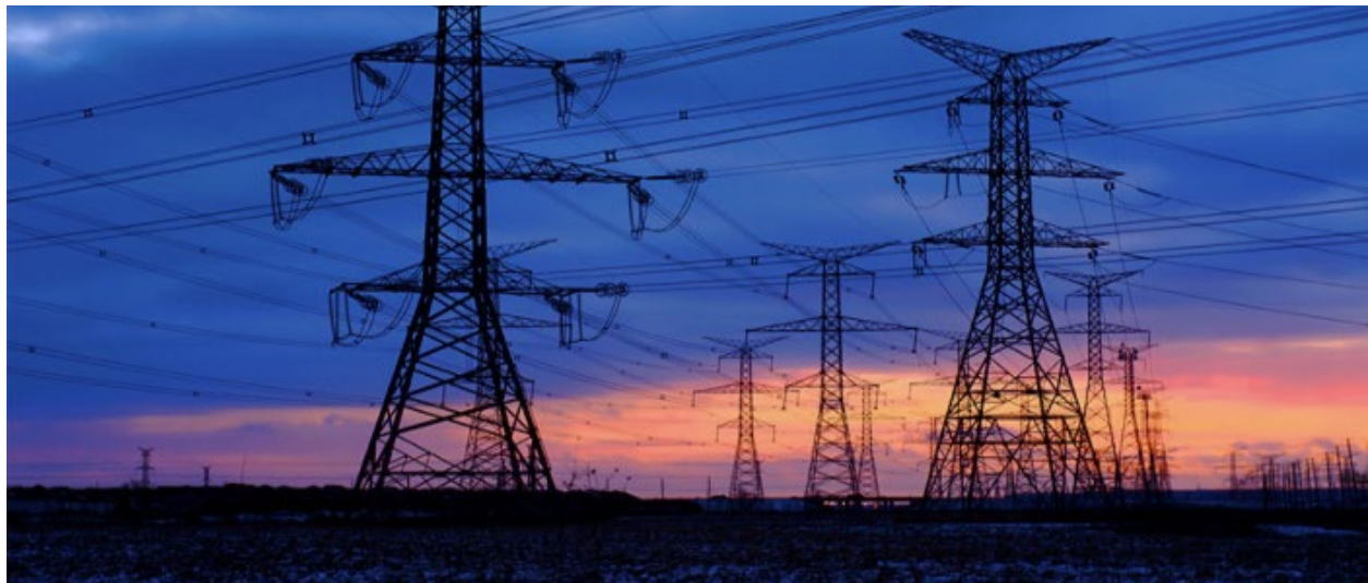
"Line 'em up" by Ian Muttoo is licensed under CC BY 2.0